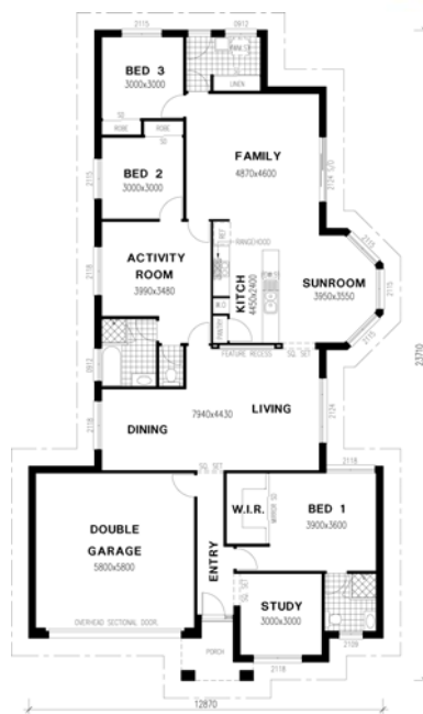
See over for larger floor plan

With three distinct spaces set aside for family, activity and living areas, the Keswick 223 is as active or as quiet as you want it to be. Overlook the Keswick's casual sunroom from your modern galley style kitchen. A large master bedroom at the front of the home provides privacy and comfort.