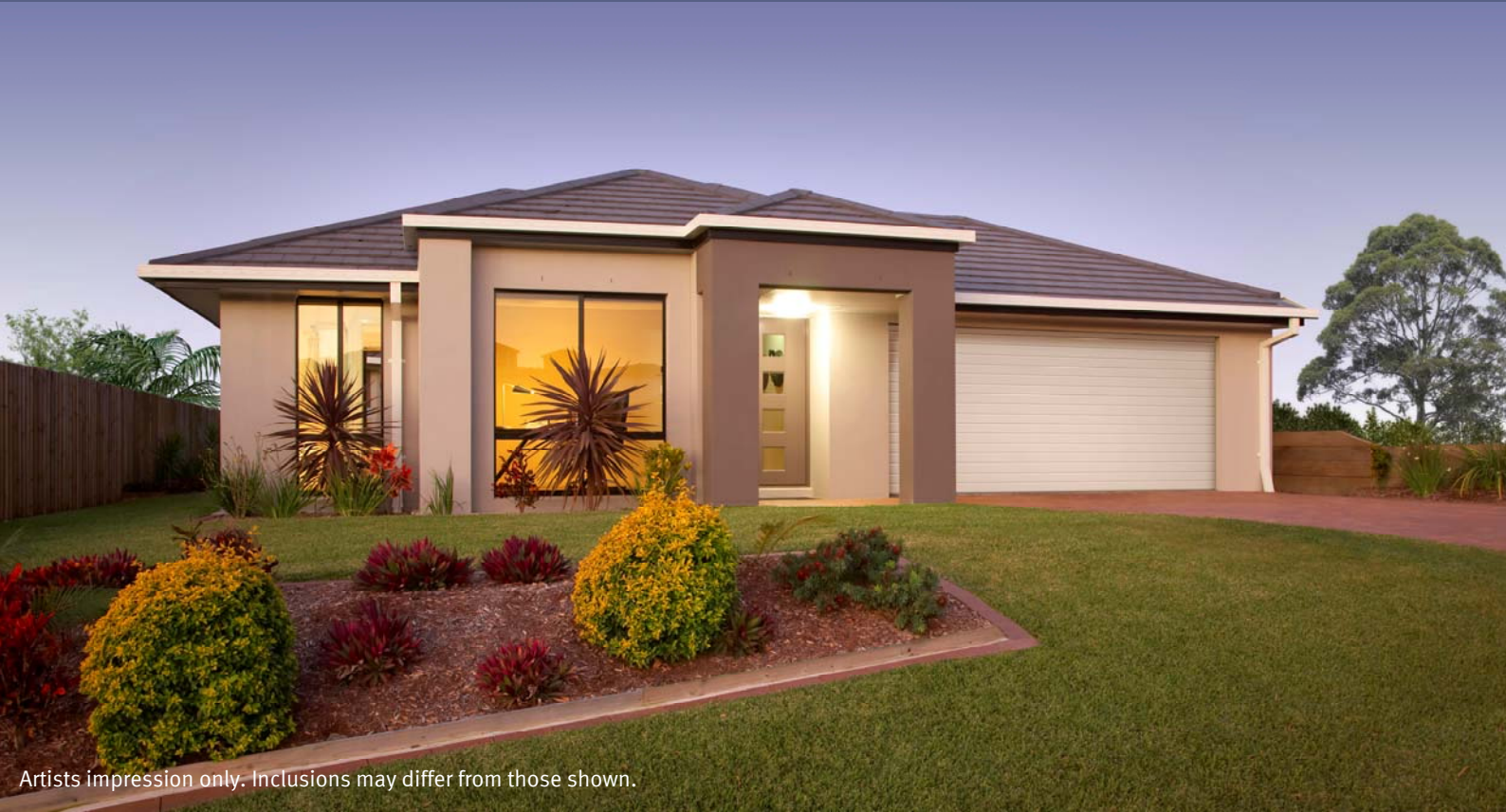
Artists impression only. Inclusions may differ from those shown.

The perfect place to build your place with Coral Homes.